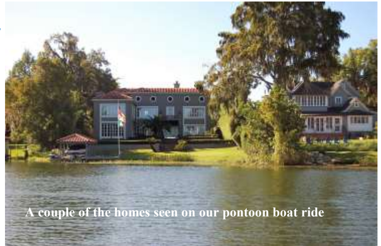
A couple of the homes seen on our pontoon boat ride

priced homes are located around a few lakes. We had a nice boat ride to check out the homes, one had over 30,000 square feet. After the boat ride we could wander the touristy street and have lunch prior to our visit to the Charles Hosmer Morse Museum which houses the largest collection of Tiffany glass in the USA, no photographing allowed.