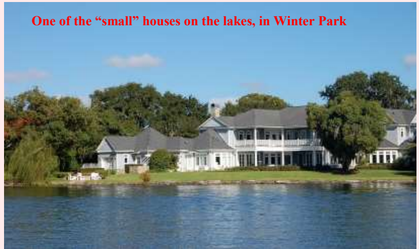
One of the "small" houses on the lakes, in Winter Park